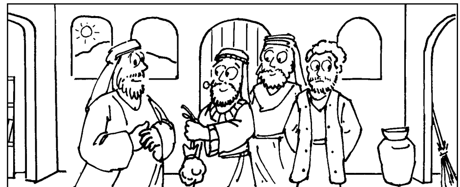
Seton Parish - Pickerington, OH