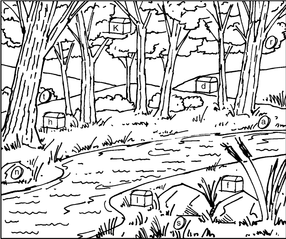
Seton Parish - Pickerington, OH

The K ingdom of h eaven is l ike t reasure hidden in a f ield.